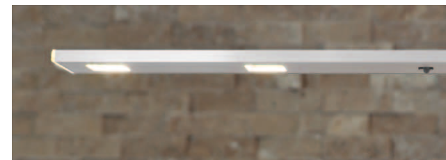
LED-Zonen, 2-Stufen-Schalter LED zones, 2-step lever switch