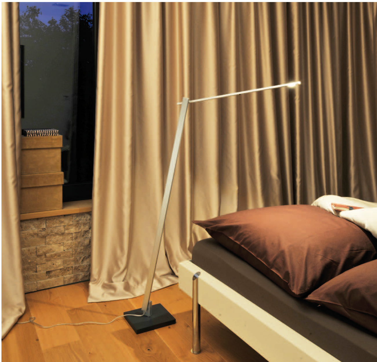
NASTRONE geschliffen, matt eloxiert brushed, matt anodised