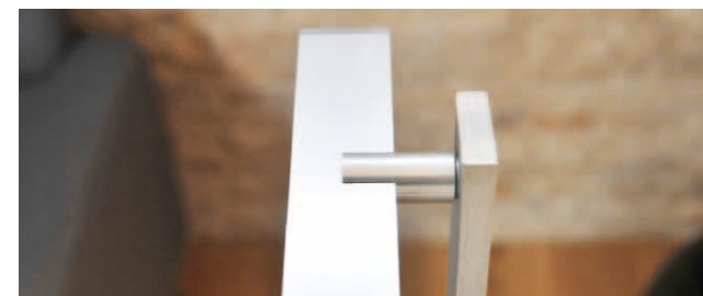
Drehgelenk Swivel joint