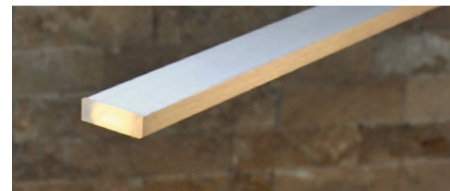
Durchleuchtete Endkappe Translucent end cap