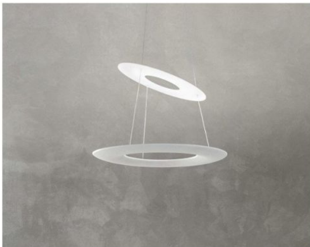
Available Versions Erhältliche Ausführungen