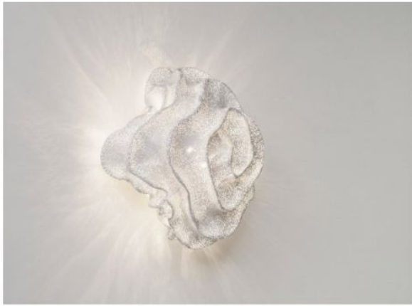
Available Versions Erhältliche Ausführungen